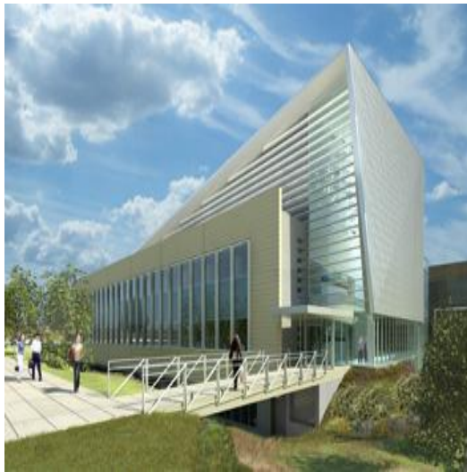
GG Brown addition

Planning efforts for the GG Brown addition continue with a goal for construction to start in late fall, 2011. The addition is planned to be built in the parking lot north of GG Brown. Construction is anticipated to take 24 months. The design is a collaboration effort of Perkins + Will (New York) and IDS (Troy, MI).